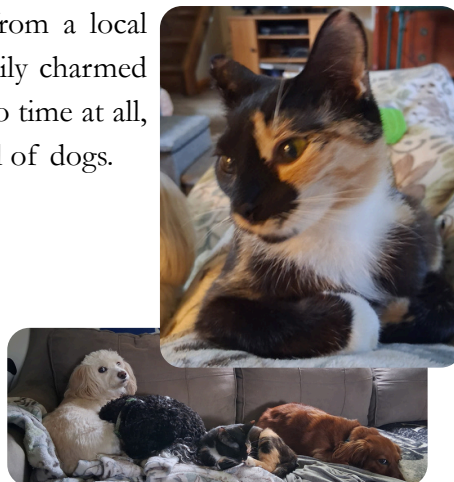
She's right in the middle!